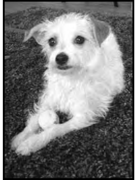
Minnie, rescued Dec. 2015, from New Mexico

We are very proud of our adoption record and to date LCHS has received and adopted out 53 of 55 dogs from Evolución. Yes, there are currently 2 dogs from Mexico available to be adopted.